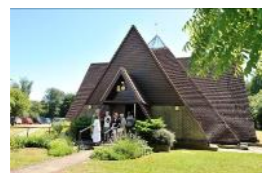
Fawkham Rd, West Kingsdown TN15 6JP