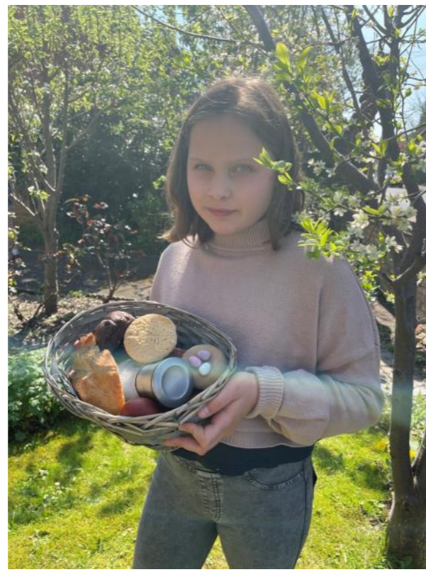
POLISH FOOD BLESSING - SWIECONKA