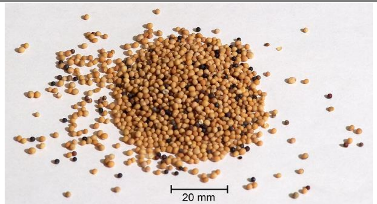
The size of a mustard seed