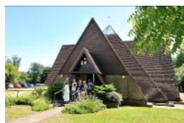
Fawkham Rd, West Kingsdown TN15 6JP