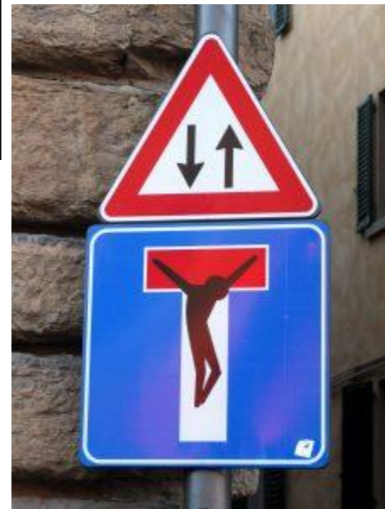
A sign seen in Florence.

..... How do I advertise my business or get my ads in the Newsletter?