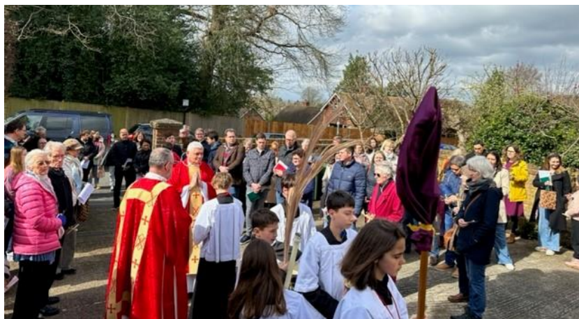
The Palm Gospel and Blessing of Palms at St Thomas's last Sunday.