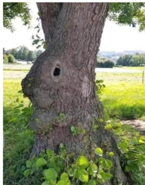
Easter Bunny or a tree?