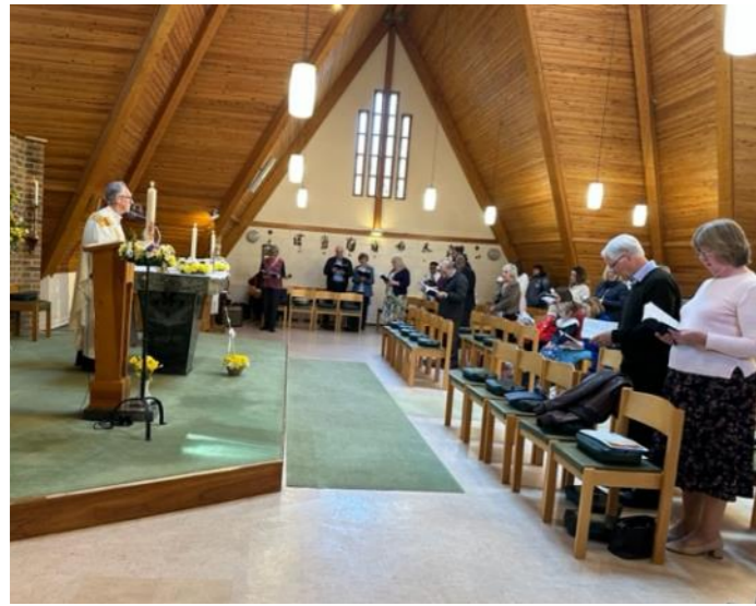
West Kingsdown, St Bernadette's